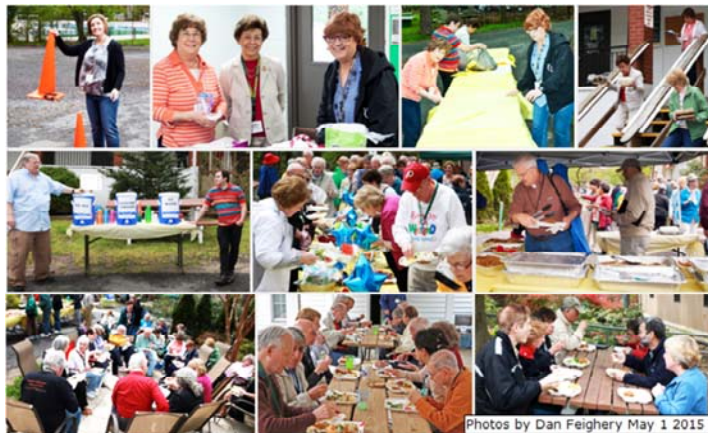
OLLI members enjoy the annual picnic on May 1.

Website What's New Catalog DocStore Facebook Officials Member Portal Contact Us