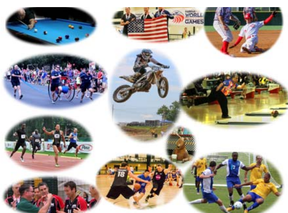
Fairfax 2015 World Police & Fire Games