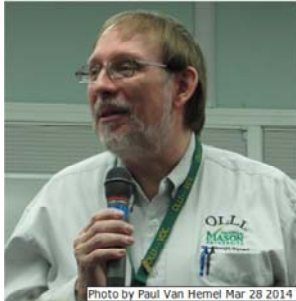
Mar 28 2014