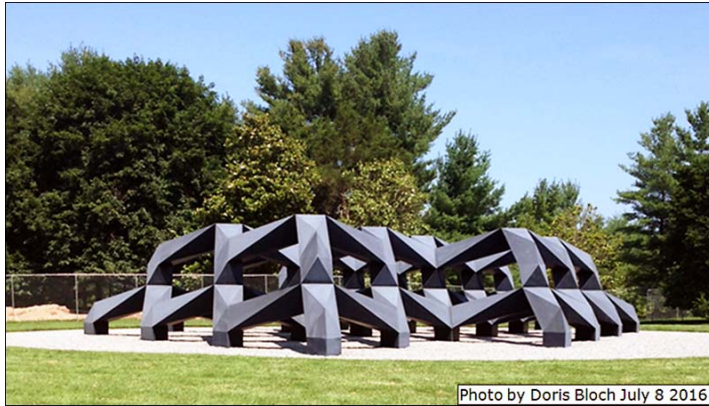
July 8 2016

Website What's New Catalog DocStore Facebook Officials Member Portal Contact Us