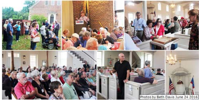
June 24 2016