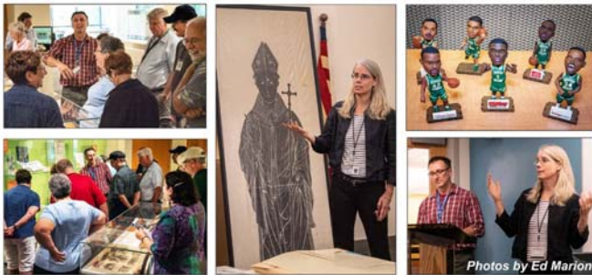
OLLI Members Visit Mason's Finley Library, July 2019 (See Article Below)

Website What's New Catalog DocStore Facebook Officials Member Portal Contact Us Loudoun Newsletter