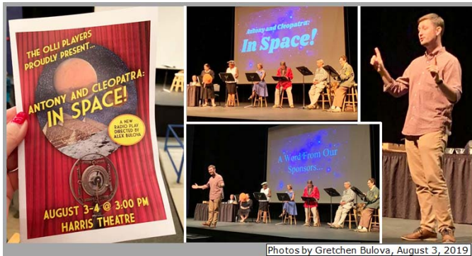
August 3, 2019

Website What's New Catalog DocStore Facebook Officials Member Portal Contact Us Loudoun Newsletter